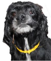
Click on Binky to Donate!