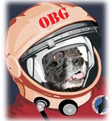
Darcy is ready to fly!

We are so very grateful for your donations to our winter campaign -- OBG has the most wonderful supporters! Alas, the number of dogs needing our help always manages to outstrip our funds. By now we have about exhausted the funds from the Holiday Drive and are bracing for the tough spring and summer months, which is when a great many dogs are dumped. OBG volunteers are busy throughout the year working to cover the dogs' medical and kenneling costs by holding local fundraising events, creating online drives, and applying for